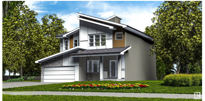
The Deveraux | 1,411 Sq. Ft.

MLS® # E4433250 Price $457,900 Bedrooms 3